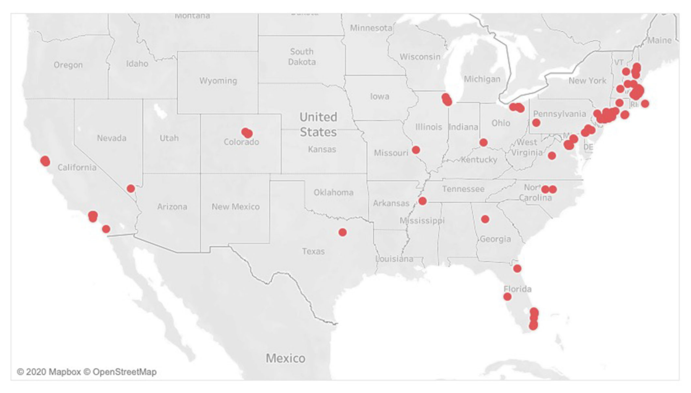
Fig. 2 Map of campers' departure locations to camp. Campers traveled from 18 states and Washington, D.C. to reach Camp Robin Hood

immediately isolated from the remaining staff. Contact tracing was initiated at this time and individual interactions were placed into low, medium, or high risk categories. Individuals placed into medium and high risk categories were quarantined from the remaining staff until the next round of sequential testing. Individuals that were placed into the medium and high risk category were able