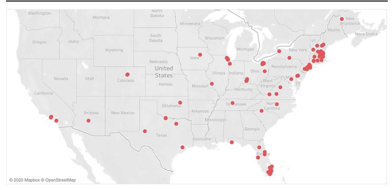
Fig. 1 Map of staff departure locations to camp. Staff traveled from 24 states to reach Camp Robin Hood in Freedom, New Hampshire, with the majority traveling from New England

was performed five days later at which point no staff tested positive for SARS-CoV-2.